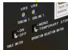
Table switch, turns photo electric sensor on or off. Mode switch, selects "Mono" for sequential banding or "Temporary" for one off banding.

Main controls: Power On Light, Tape Feed, Reset, and Start buttons.