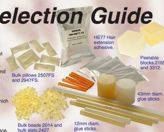
Bulk pillows 2507FS and 2947FS.

Polyamide Glues: High performance. Excellent chemical and temperature resistance.