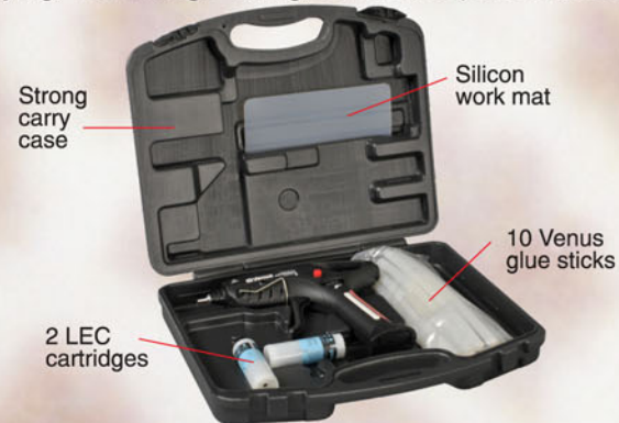
Strong carry case Silicon work mat 10 Venus glue sticks 2 LEC cartridges

The GasGlue 600 runs on refillable (LEC) liquid energy cartridges. It doesn't require mains electricity or batteries and weighs just 390g. Each LEC refills from a standard butane cigarette lighter canister and keeps the GasGlue 600 running for approximately 1.5 hours. To start up just turn the gas dial and press the Piezo ignition button. The GasGlue 600 reaches operating temperature in just 5 minutes and is thermostatically controlled to give the optimum temperature for the best glue delivery. Because it is totally portable the GasGlue 600 is the ideal glue gun for applications where mains power might not be available: shop fitting, exhibition displays, flooring and carpet laying, low voltage wiring, car dent repairs. Melt rate: 1.7kg per hour.