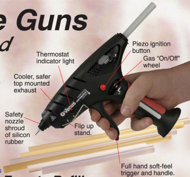
Thermostat indicator light Piezo ignition button Gas "On/Off" wheel Cooler, safer top mounted exhaust Safety nozzle shroud of silicon rubber Flip up stand. Full hand soft-feel trigger and handle.