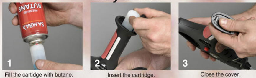
1 Fill the cartridge with butane. 2 Insert the cartridge. 3 Close the cover.

Comes in a tough carry case with a choice of special purpose Venus hotmelt glues for cabling, flooring or auto dent repair.