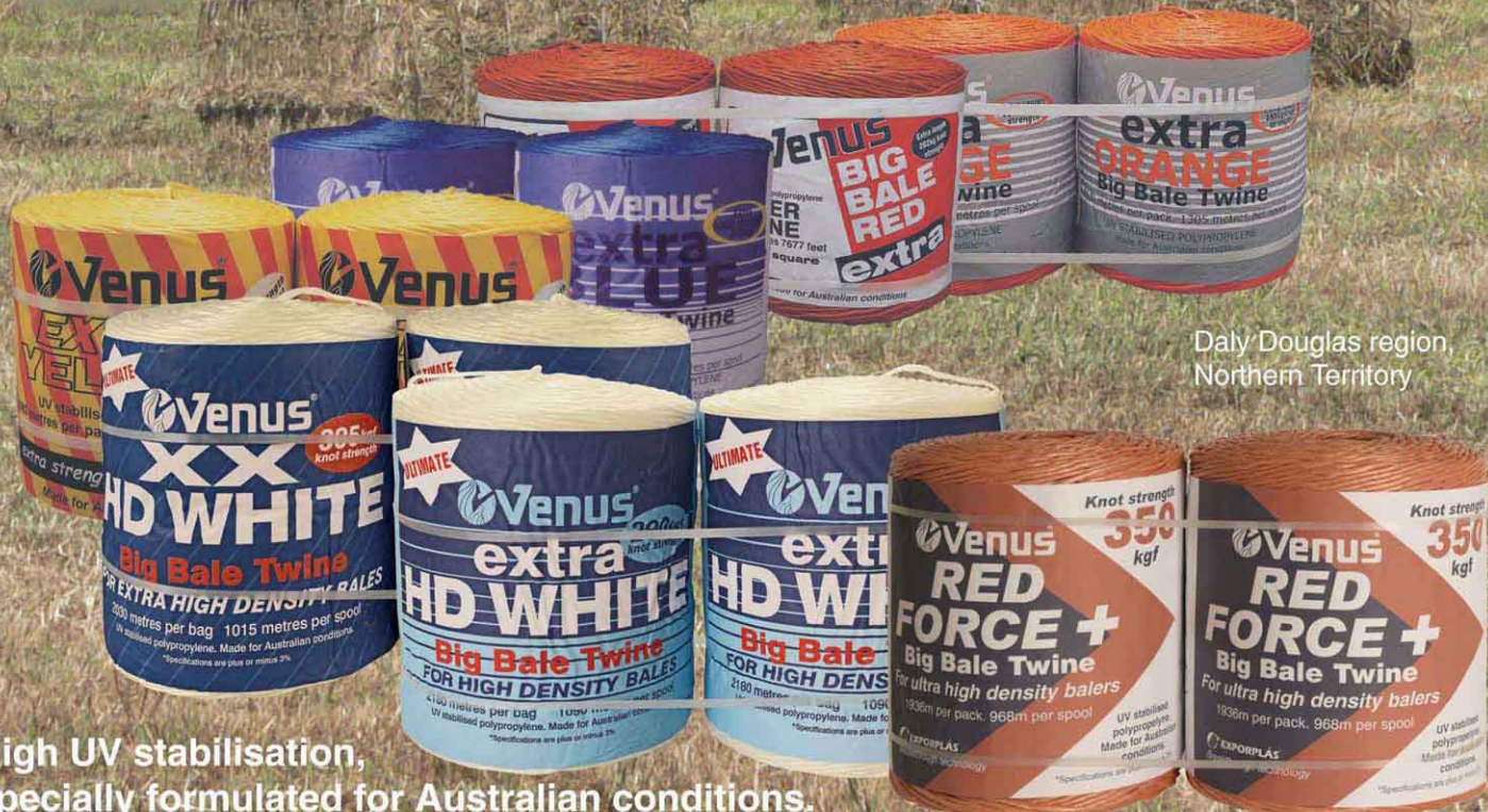
Daly Douglas region, Northern Territory

High UV stabilisation, specially formulated for Australian conditions.